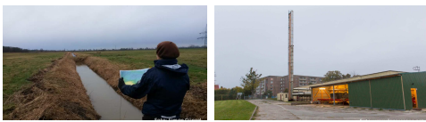
Fig. 1: Planning for rewetting (left) and Malchin heating plant (right).

Agriculturally used peatlands cover 72,000 ha (about 10 %) of Vorpommern (North East Germany, both administrative districts Vorpommern-Rügen and Vorpommern-Greifswald). However, the potential for climate protection by rewetting is high. Only 200 ha are already under peat-preserving, 3,500 ha under slightly peat-debilitating conditions. To achieve the Paris climate protection goals, about 2,300 ha agriculturally used peatlands have to be rewetted in Vorpommern each year until 2050.