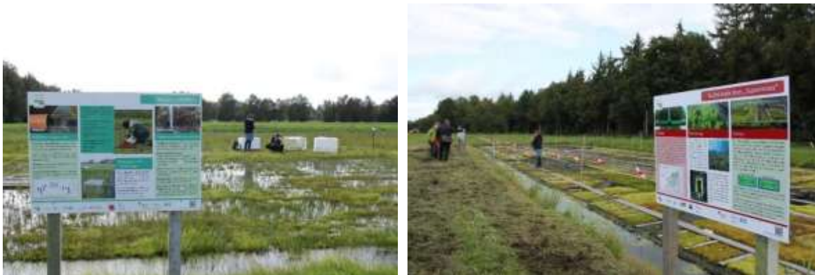
14 Greenhouse gas measurements and information boards at the pilot site at Hankhauser Moor

Win-win-win thanks to Sphagnum mosses - that was shown on September 4 th 2020 at the 2 nd information day on peat moss ( Sphagnum ) cultivation on the pilot site in the Hankhauser Moor north of Oldenburg: Sphagnum can bring a new income source to rural areas and provides a double win for climate protection. Their cultivation transforms conventional raised bog grassland into a climate-friendly production system that stops peat degradation and loss. In addition, Sphagnum can replace the finite resource peat in horticulture and thus also help to save greenhouse gas emissions. The Hankhauser Sphagnum farming site provides another example that Lower Saxony is a pioneer in sustainable peatland management (paludiculture) and climate protection.