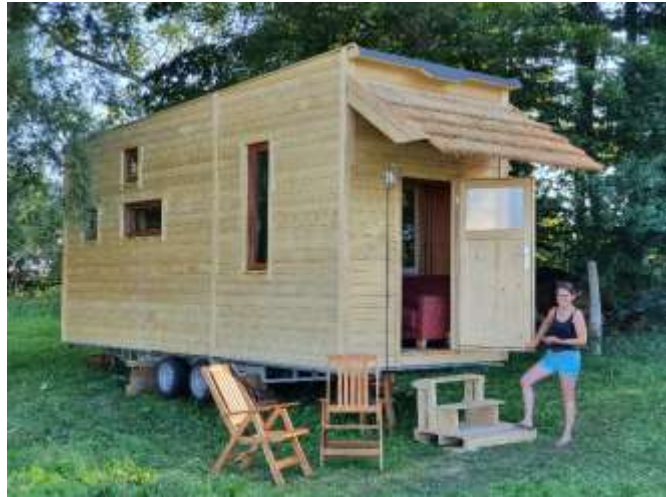
8 The tiny house is ready for visitors and guests

In the tiny house, Alder is in the panels of the interior wall cladding and in the solid kitchen worktop. Reeds are used to cover the canopy roofs, for wall insulation as insulation panels in the form of bundles from Reed stalks (both from the Hiss Reet company) and in the fiberboard of the cabinet (Zelfo Technology). Cattail is used in different forms as insulation material: 1) pure seed wool as blow-in insulation, 2) blow-in insulation from the whole plant (leaves, cobs, stems) prepared by the company Hanffaser Uckermark and 3) Typhaboard panels manufactured by the company Typhatechnik. For the latter, cattail leaves are cut uniformly in length and width and then pressed into the form of OSB panels using mineral glue. Insulating mats made of grass (Gramitherm company) are also installed. Sedge and wet meadow hay was fibrillated by Zelfo Technology and then pressed into sheets, whereby the fibers adhere to themselves and no additional glue is needed. The colored plates - partly as sandwich panels with a firm outer layer and a loose core - were used as furniture panels for the integrated staircase in the tiny house. A pellet stove serves as heating and can be equipped with pellets from paludiculture.