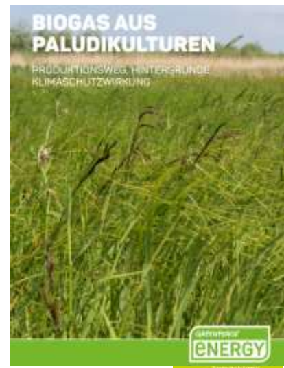
11 Cover of the brochure "Biogas from paludiculture"

Pellets, briquettes, bales from paludiculture for heat generation - there are several research projects about this underway and a biomass heating plant already working satisfactorily. But could biogas also be obtained from paludiculture? In a first study , scientists from the Institute for Biogas, Circular Economy and Energy in collaboration with DUENE e.V., partner in the Greifswald Mire Centre, examined this on behalf of Greenpeace Energy. The result: It makes sense to use reeds, sedges, reed canary grass or cattail in biogas plants, since these plants are a particularly climate-friendly renewable energy source. In addition to reducing greenhouse gas emissions, a change to wet peatland management is replacing fossil fuels. If a medium-sized household were to switch from natural gas to biogas from paludiculture, it achieved an annual greenhouse gas reduction of 31.8 t. This corresponds to a drive of approx. 250,000 km in a mid-range car with CO 2 emissions of 125 g / km.