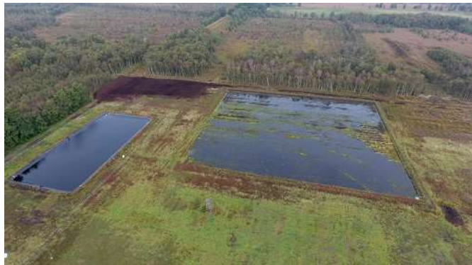
13 From the bird's eye view: the Barver Sphagnum farm flooded after heavy rain

This is exactly what the recently awarded sphagnum farm Barver does: It grows peat moss ( Sphagnum ) on typical, degraded raised bog grassland. It aims to make paludiculture better known in the region, provide practical experience and contribute to climate protection. The European recognition of Diepholz's peatland protection commitment makes the subject of paludiculture even more visible for the EU institutions. The Barver Sphagnum farm was implemented as part of the CANAPE Interreg project .