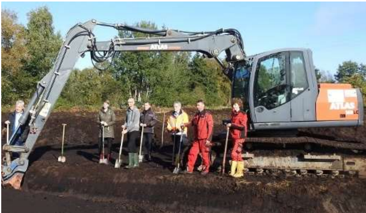
12 Ground breaking ceremony for the paludiculture pilot site in the community of Ganderkesee

From the raw materials - Cattail and Reed biomass - the project partners Jade Hochschule Oldenburg, the Technical University Ostwestfalen-Lippe, Floragard Vertriebs-GmbH and the 3N Kompetenzzentrum e.V. develop products such as insulation materials and peat substitutes and test them in practice. Currently, a ca. 300 m long polder dam with a ring trench is being built for the pilot plantation. Photovoltaic systems provide electricity for the water pump. A weather station will be built next to the test pole.