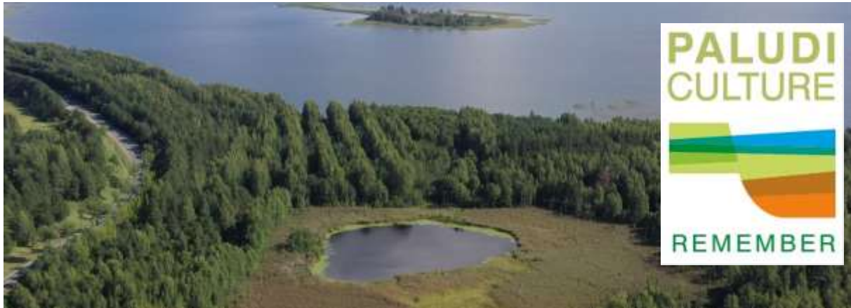
2 Naroch Lake in the Memel catchment area

The role of emergent macrophytes in reducing the biogenic load on aquatic ecosystems