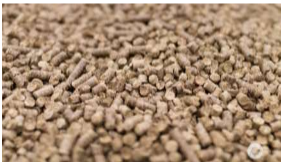
6 Pellets from reed biomass

On December 10th and 11th 2020, the Greifswald Mire Centre and Landcare Germany offer a free video event on bioeconomy with a climate protection bonus - utilisation of peatland biomass , each from 10 a.m. to 12 a.m. The session on the first day deals with material use e.g. as building material, that on the second day deals with energetic use and production of substrates. The information event provides a practical overview of how biomass from wet and rewetted peatlands can be used, which sales markets there are, and how these can be adapted and established for reeds, Sedges, Cattails or peat moss with presentations from companies and experts.