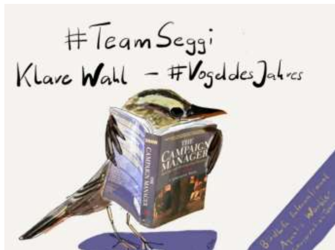
1 Illustration #TeamSeggi (Illustration: S. Maier)

And there is hope: in the past year, Aquatic Warblers were brought from Belarus to Lithuania and resettled there in restored fens. The nomination for “Bird of the Year 2021” would not only give the Aquatic Warbler an upswing, but would also draw attention to peatlands and their importance for climate protection. The Aquatic Warbler Conservation Handbook summarizes the current state of knowledge on ecology, habitat management and protection of the Aquatic Warbler. Information is also provided on the website of the Aquatic Warbler Conservation Team (AWTC) , which also includes scientists of the GMC.