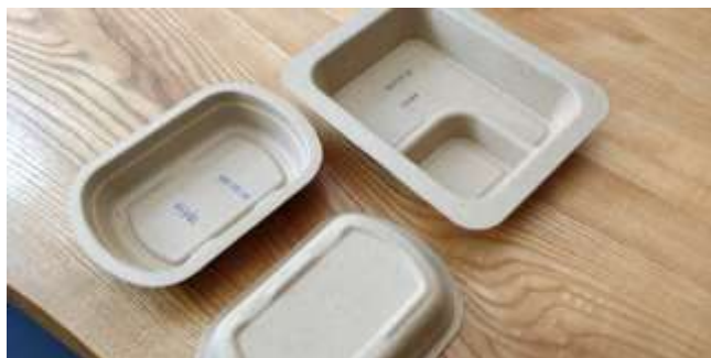
7 Mouldings from reed

Biomass from wet peatlands is still a demanding raw material for which the sales markets still have to be further developed. It can contribute to climate protection in various ways: by reducing greenhouse gas emissions from the peat soil used under wet conditions, by replacing fossil raw materials and by long-term carbon storage, e.g. in building materials. Whether as packaging, moulding, insulating material, peat substitute or for generating heat or electricity - every product entails also climate protection.